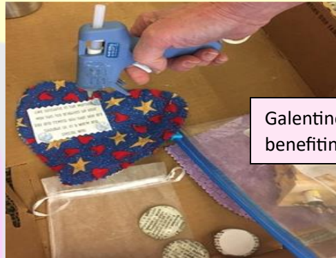
Galentine crafting event benefiting Ziggy's Art Bus.