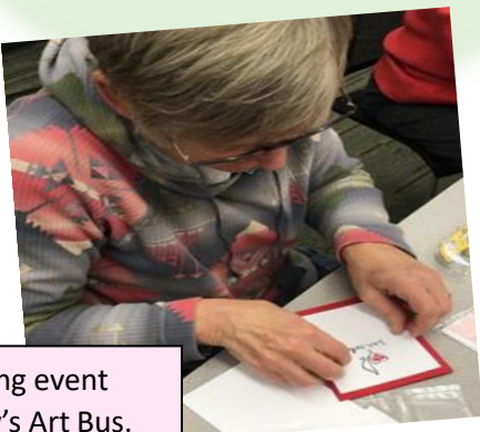
Galentine crafting event benefiting Ziggy's Art Bus.