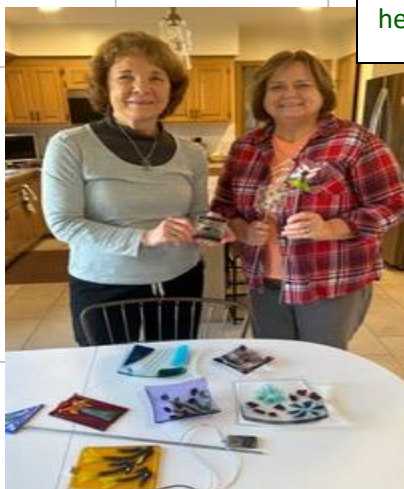
heART Speaks Glass fusing creations!