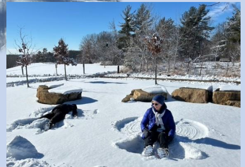
Trekkers enjoying our February snow fall!

Browse clipboards at monthly meeting: add your name if you are not already on the email